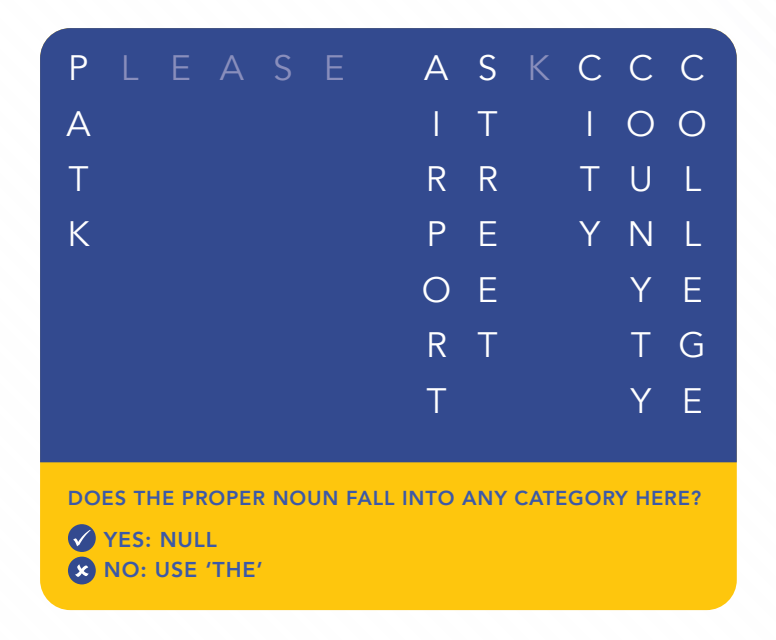
FIGURE 1: Please ASK heuristic categories.

At the time of this writing, there existed no known means to explain correct article usage before English proper nouns (Butler, 2012; Huebner, 1983; Leśeniewska, 2016; Master, 2003). The reason for this is that English as a Second Language literature and research did not present a clearly mapped out system for proper noun article grammar (Butler, 2012). As a result, this lack of a clear explanation left learners with very limited recourse: guess or memorize.